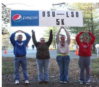
50th Anniversary Recap Page 2