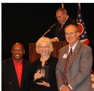
Year of the Alumni Page 3